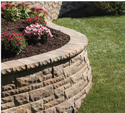
BelAir Retaining Wall

You can install the BelAir Wall™ retaining wall system in a random pattern using any combination of units. Just avoid vertical lines that span more than 18 inches in height. If you are building a wall without geosynthetic reinforcement, use a pattern for inspiration or follow a pattern exactly. Pleasing random patterns can be built using an equal number of 3- and 6-inch-high units. The estimating formulas in this brochure are based on using an equal number of units of each size in each height. When building a wall that includes geosynthetic reinforcement, using a pattern at the appropriate spacing eliminates the need to cut the grid. When using a pattern, begin at one edge laying the units as indicated. Install at least one repeat of the pattern to establish the pattern before proceeding to the next course.